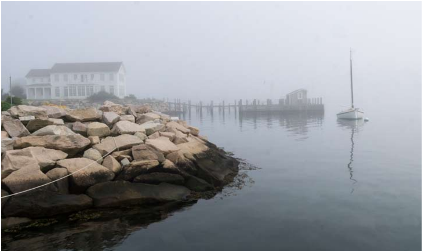
Early morning fog - Mystic Harbor