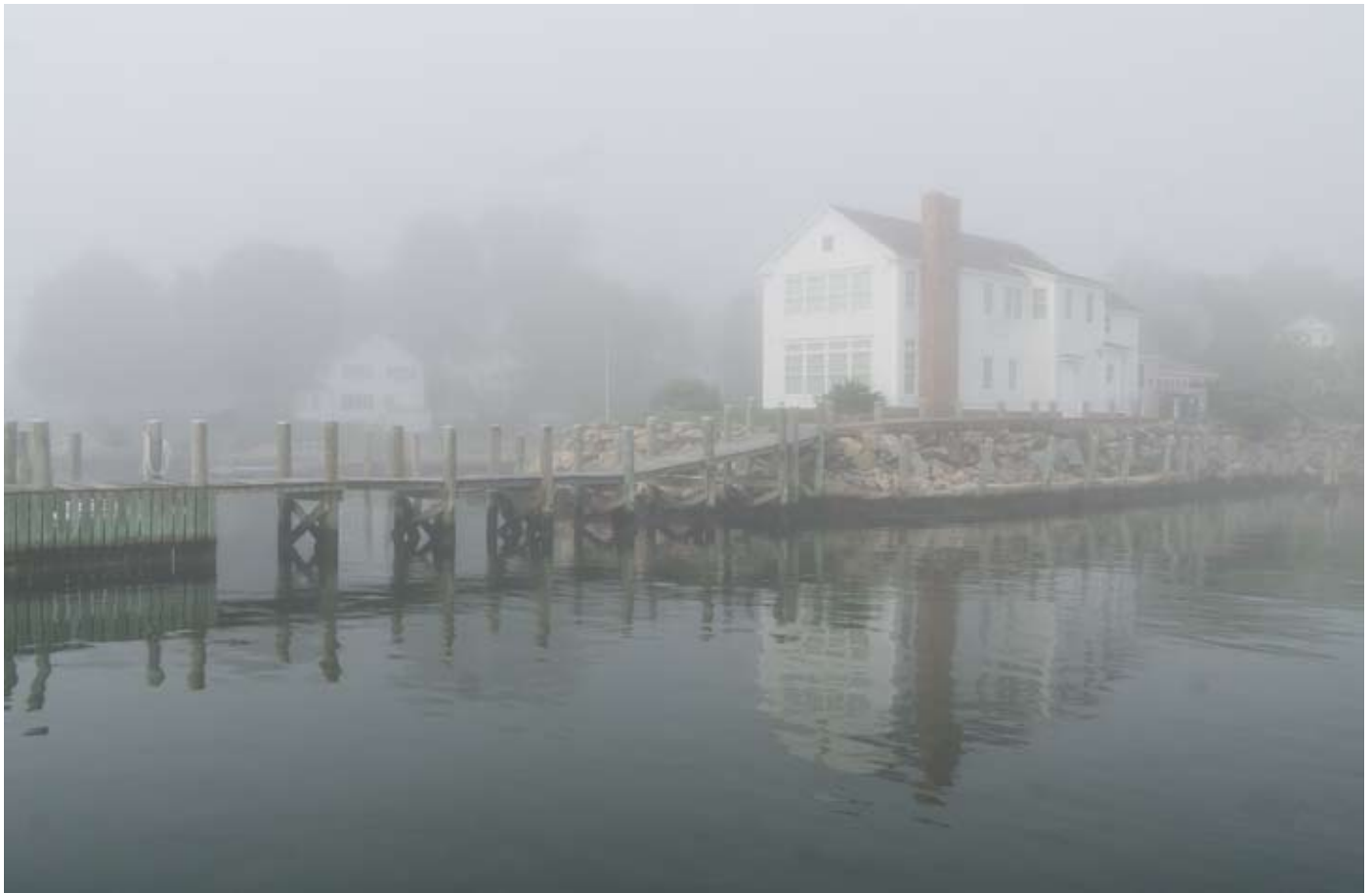
Front Street, Noank residence, in the fog