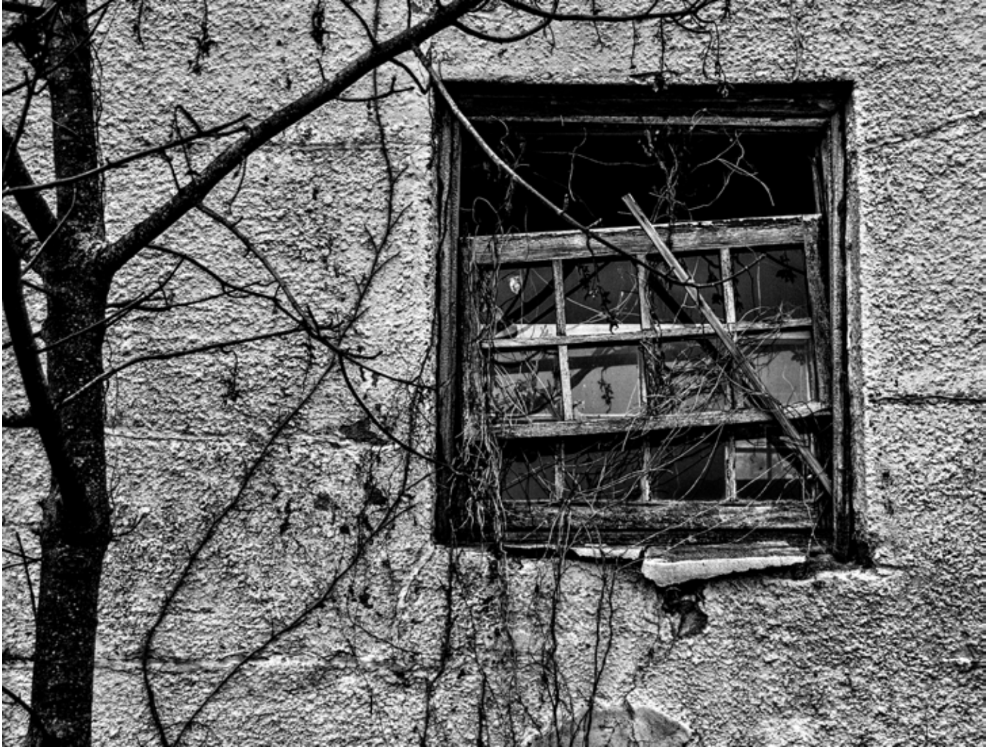
Window to the Noank Aquaculture