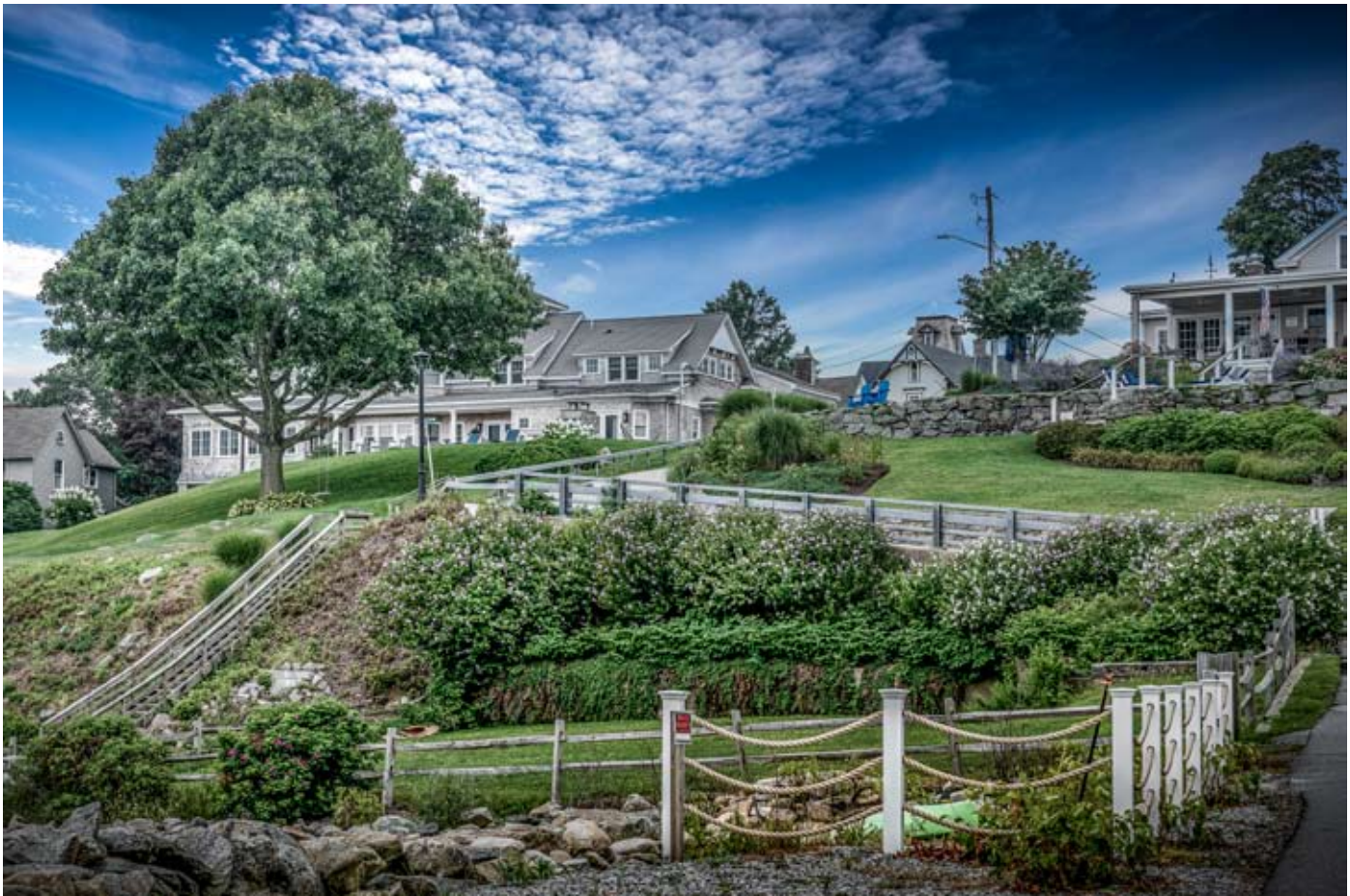
Snake Hill, Noank