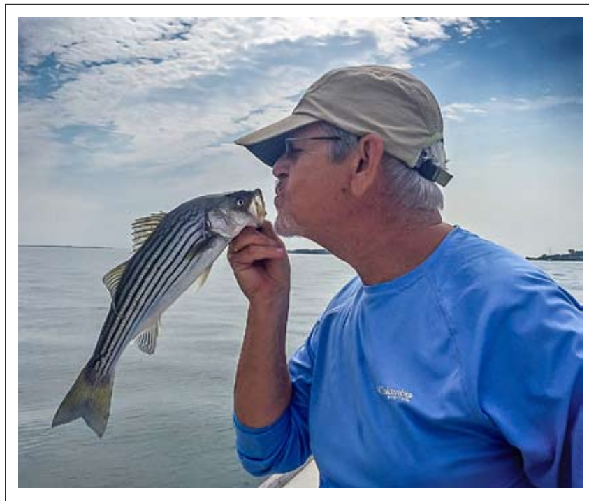
Me Kissing Supper

Photographs in and around Mystic Connecticut 2025