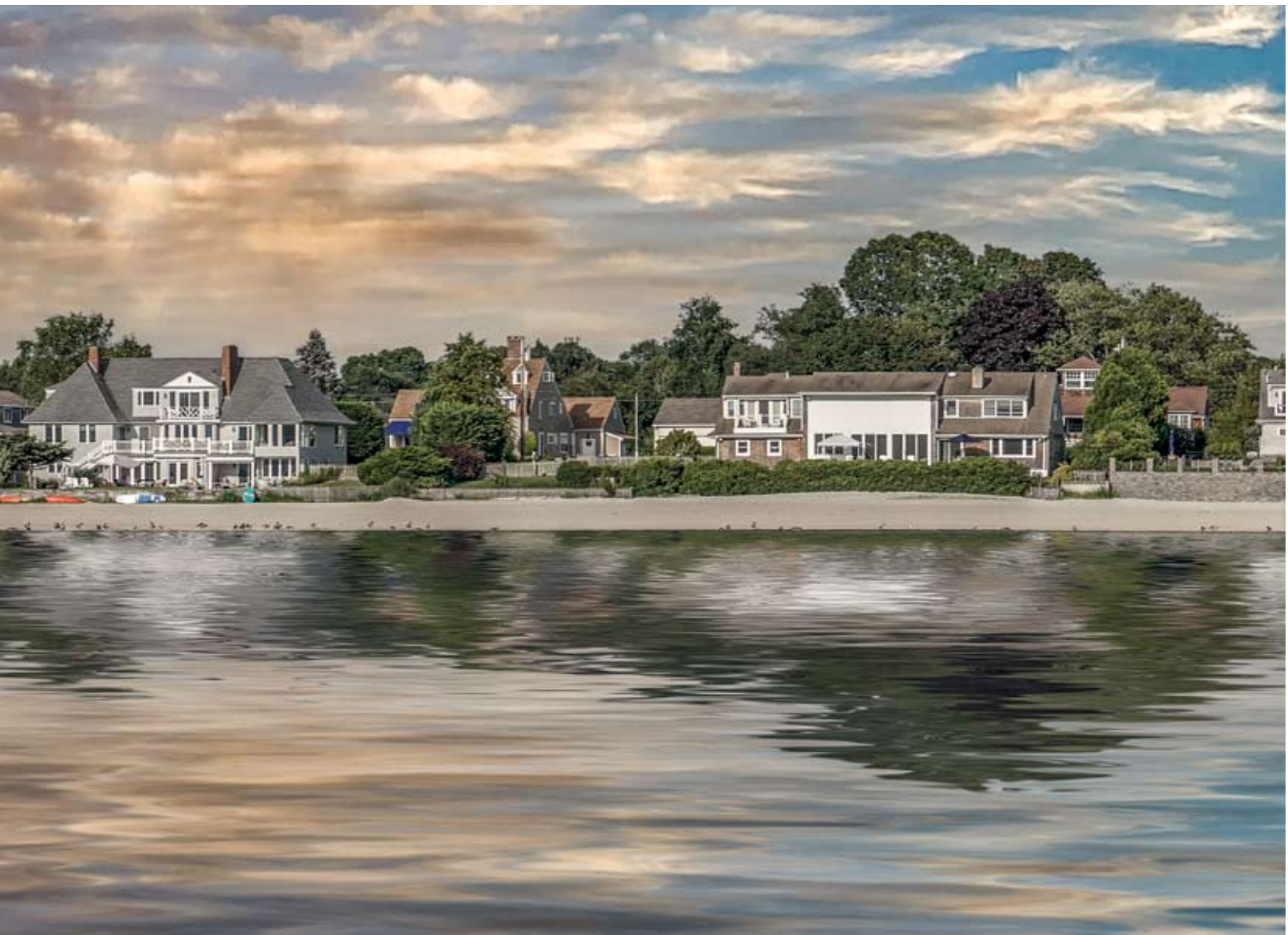
Groton Long Point Yacht Club