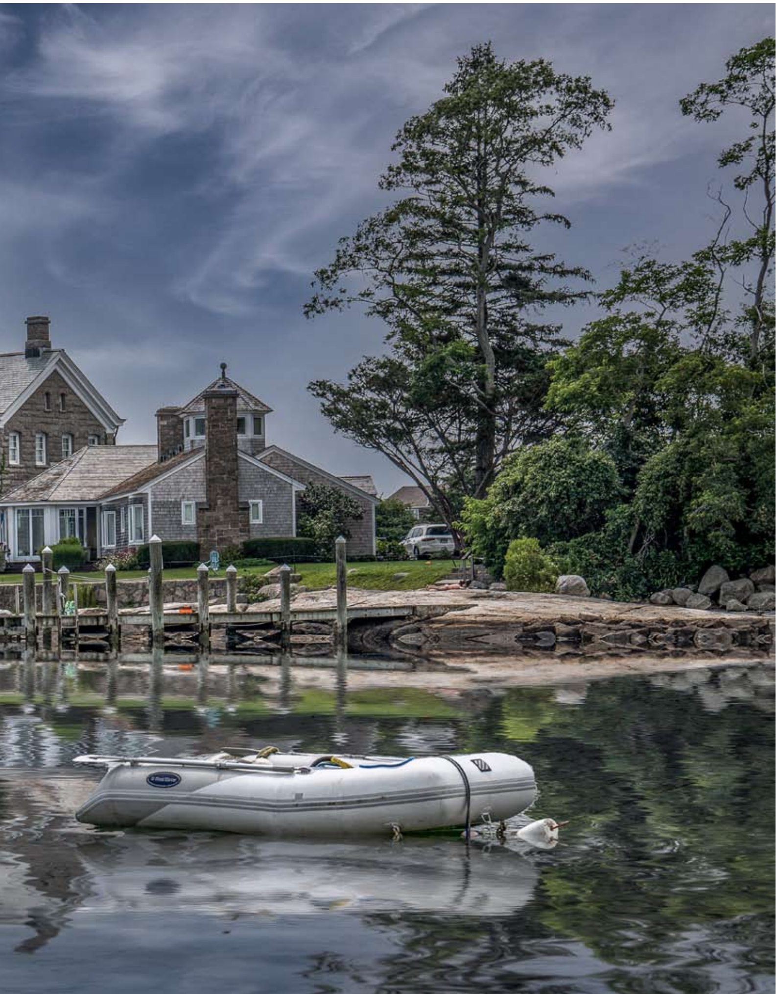
Morgan Point - Lighthouse House