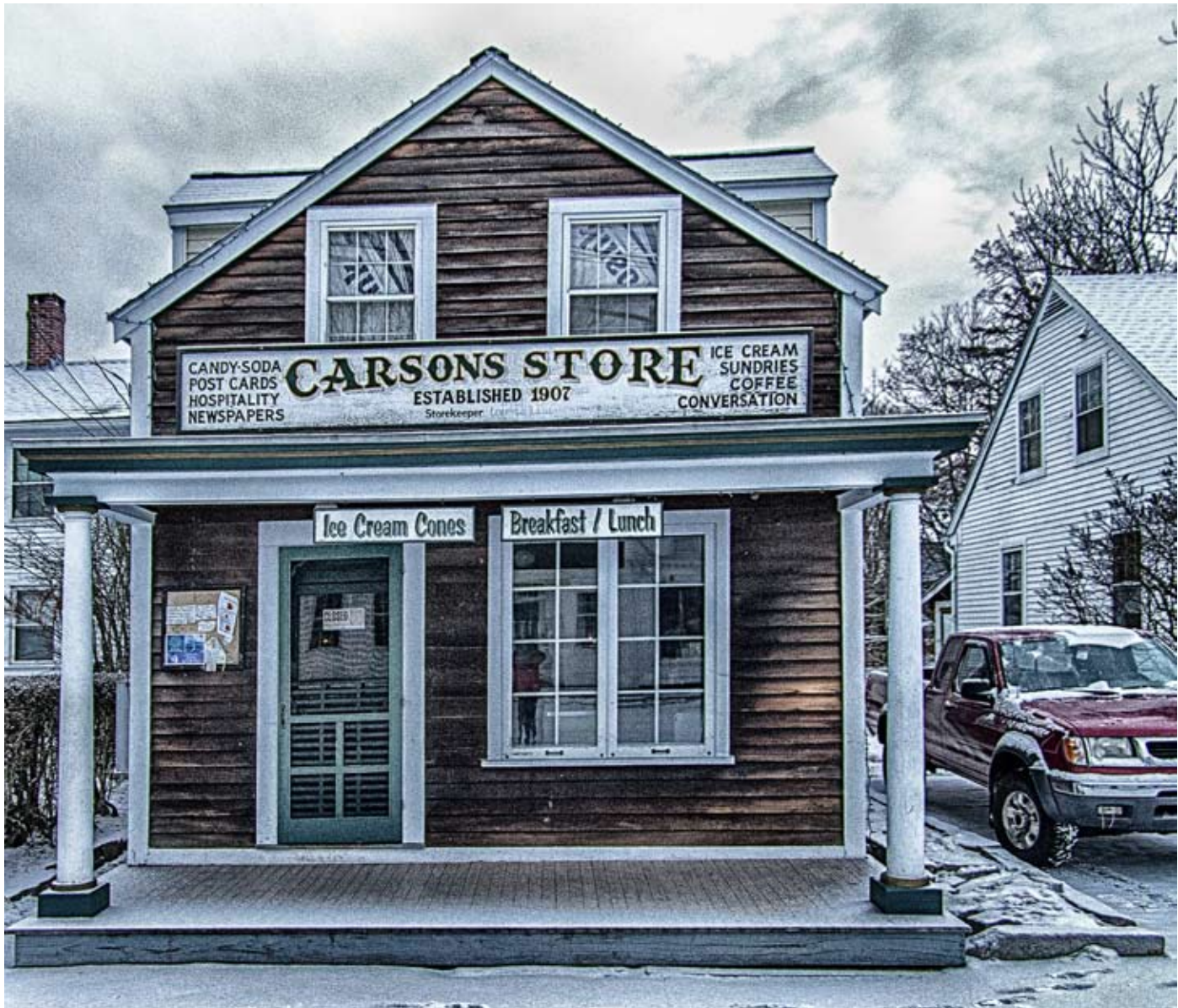
Carson's Store everyones favorite, established 1907