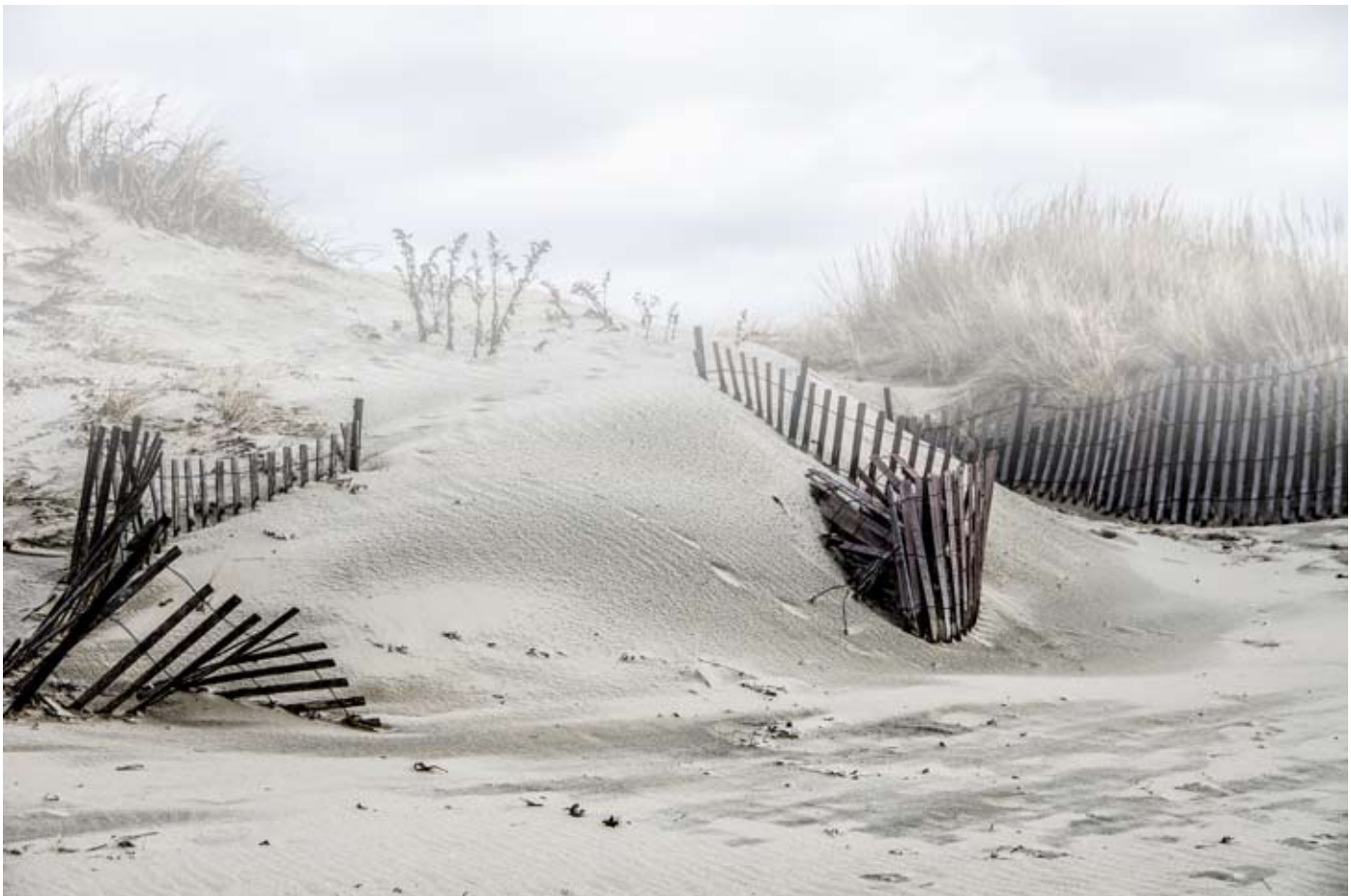
Napatree Point Conservation Area Watch Hill, Rhode Island