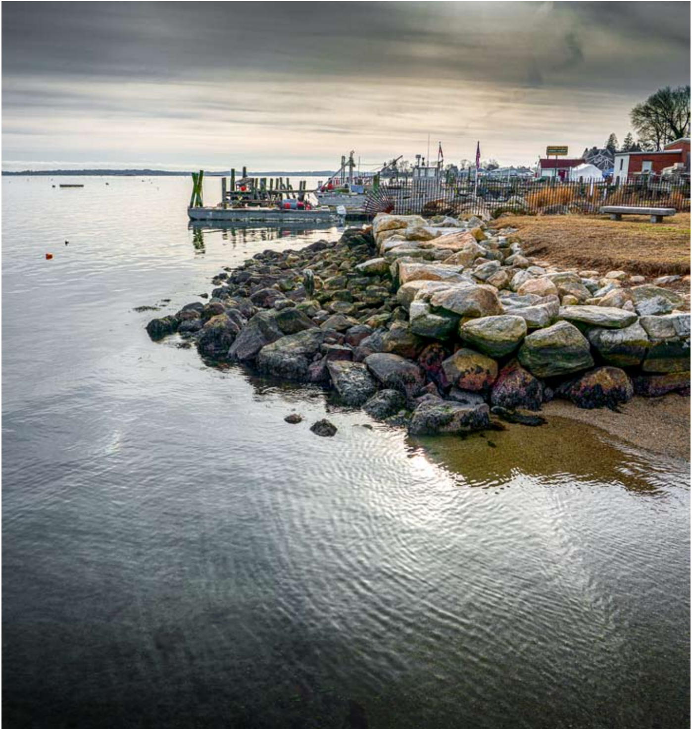
Noank Town Beach Mystic Oyster Co. in background