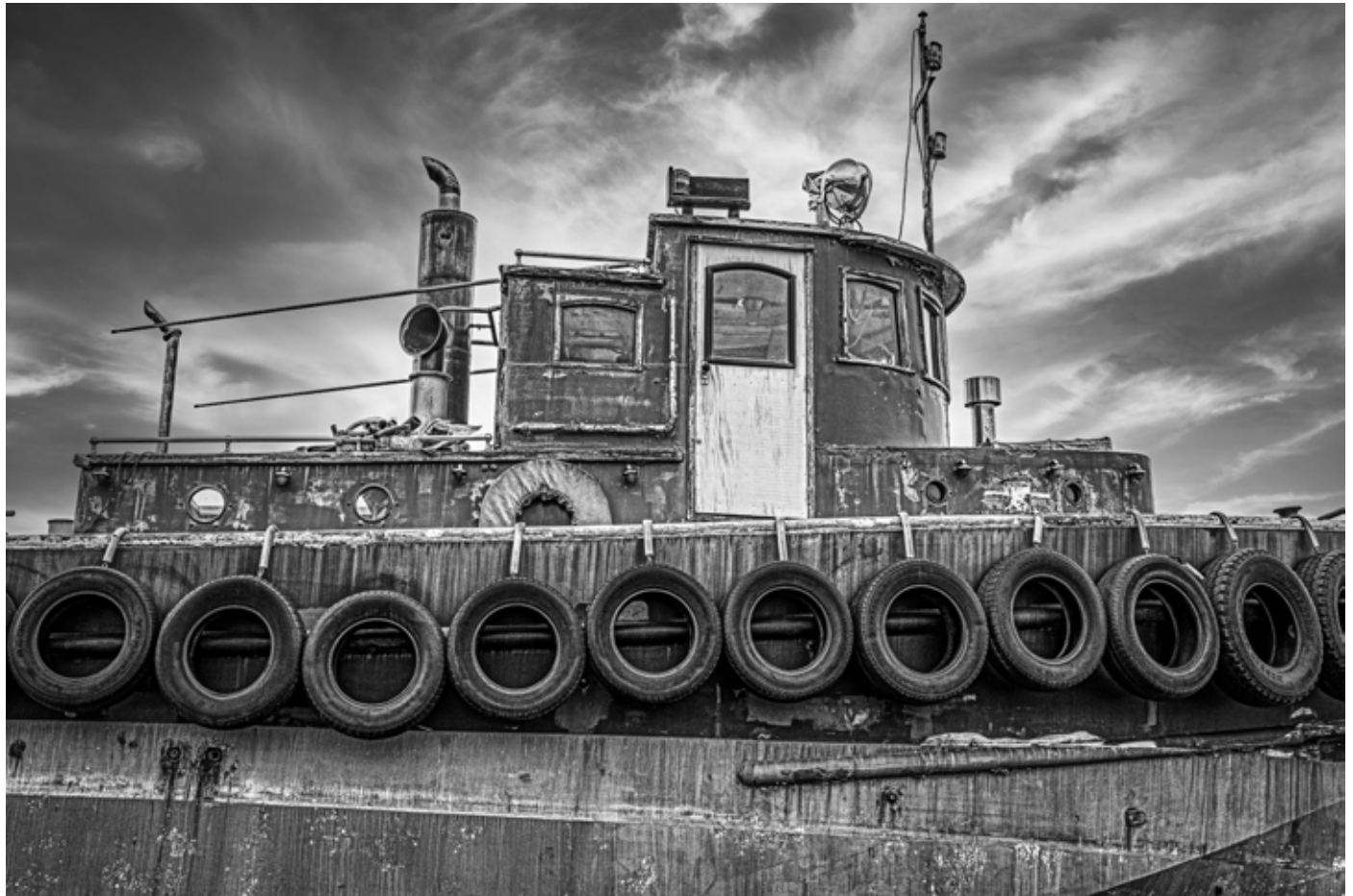
Seaport Marine on Washington Street in Mystic, CT