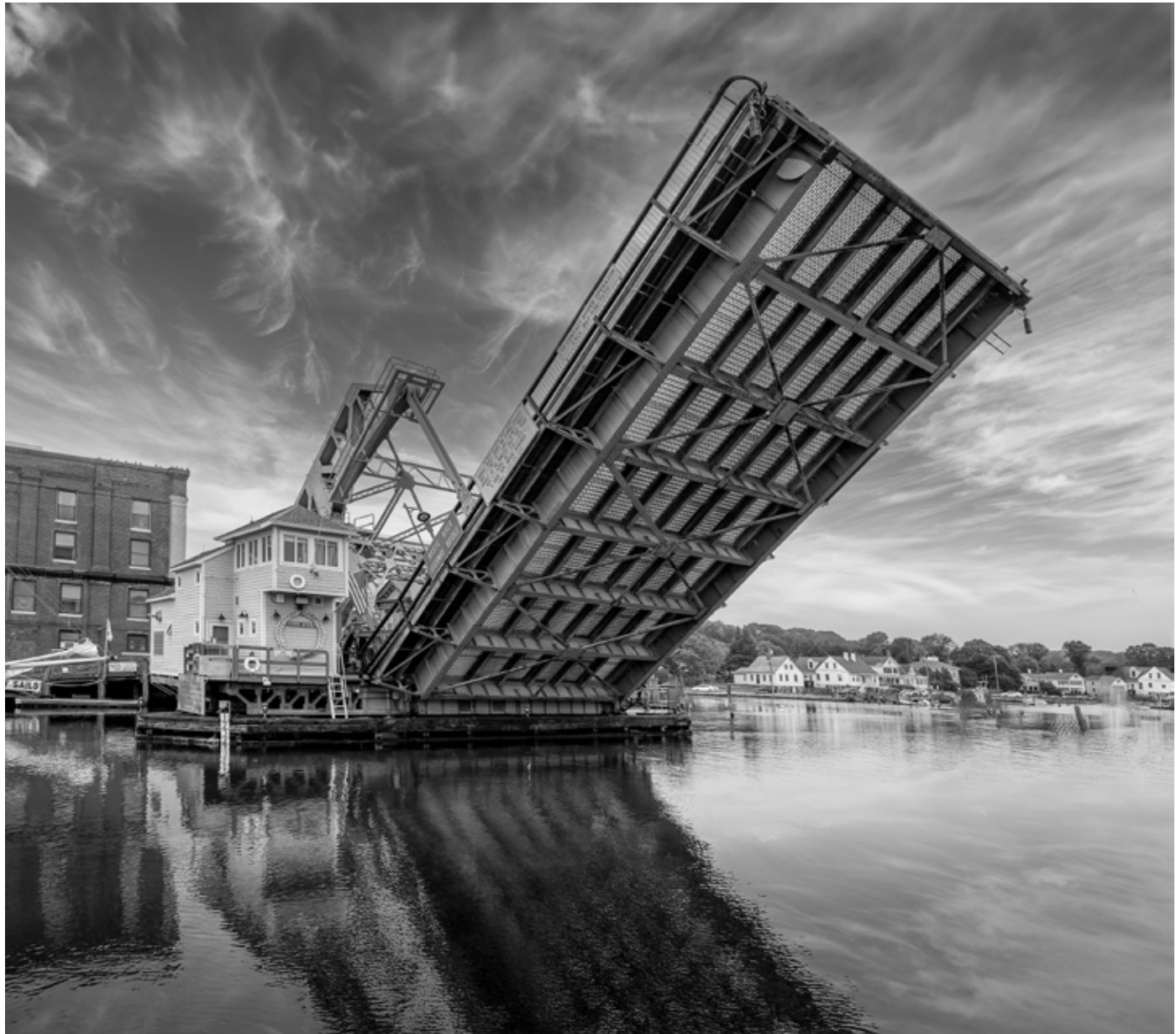
Mystic River Bascule Bridge is a bascule bridge spanning the Mystic River