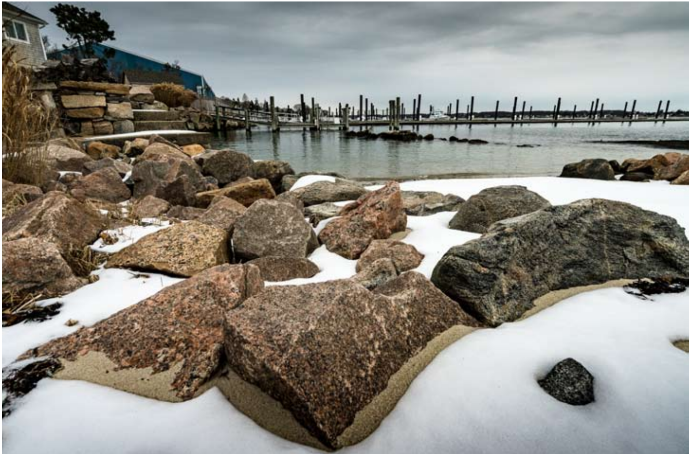
Snake Hill Beach in the snow