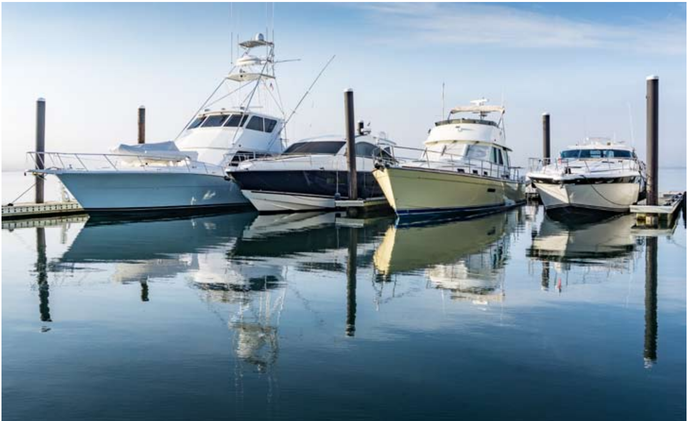
Fishing boats in Fishers Island Sound