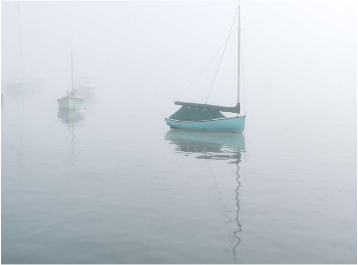
Sailboat in fog - Mystic Harbor