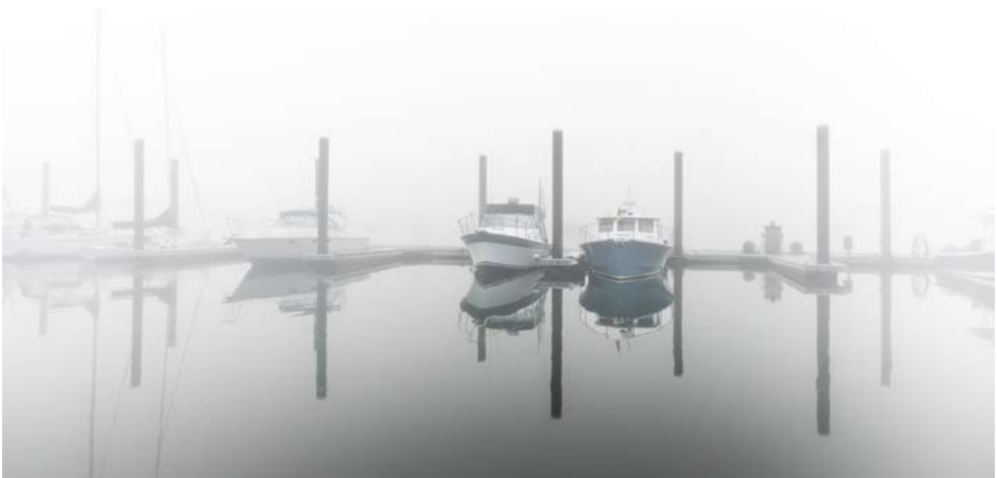
Fishing boats in the fog