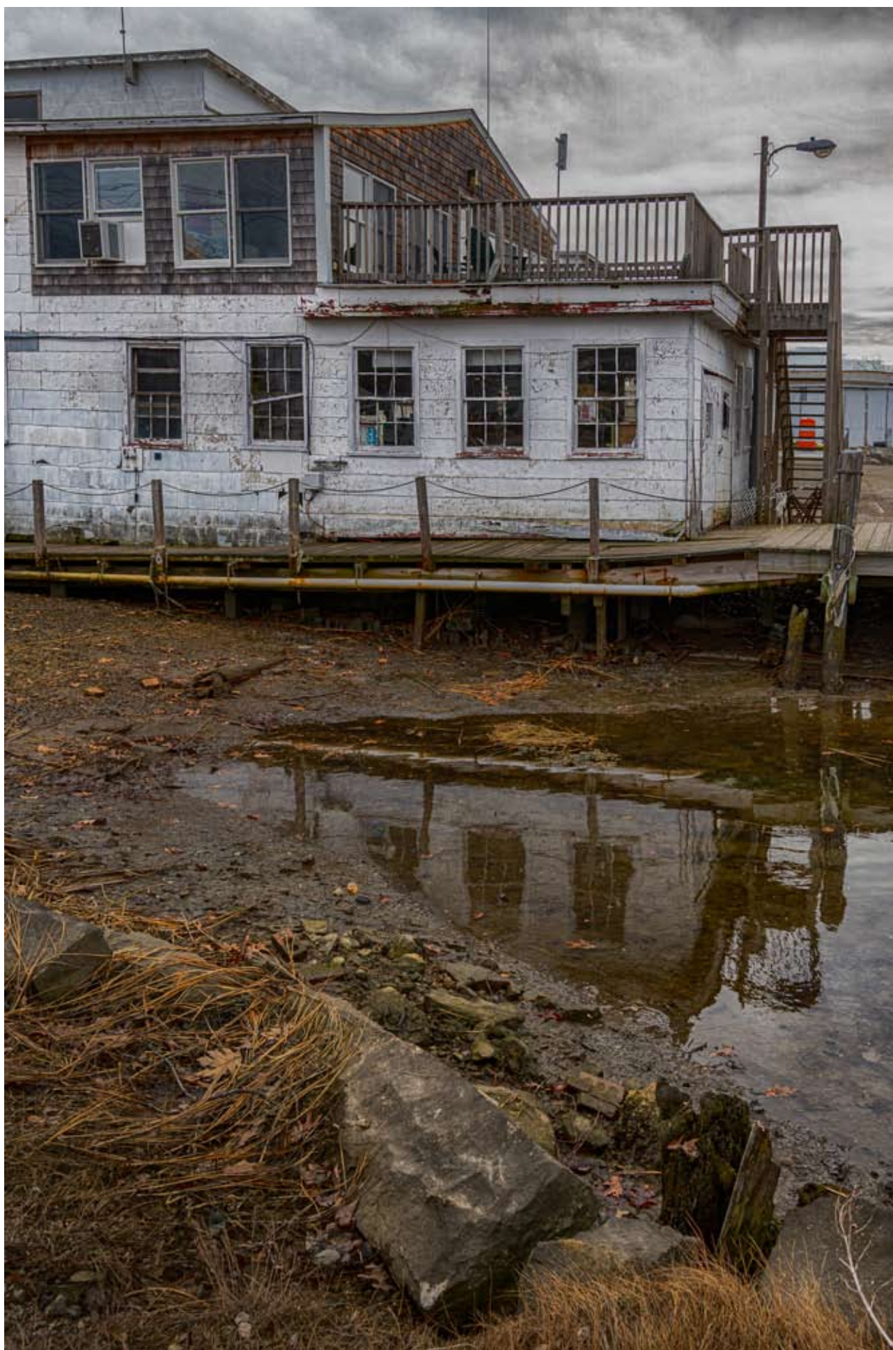
Seaport Marine on Washington Street in Mystic, CT building burned down, 14-alarm fire November 27, 2022ant