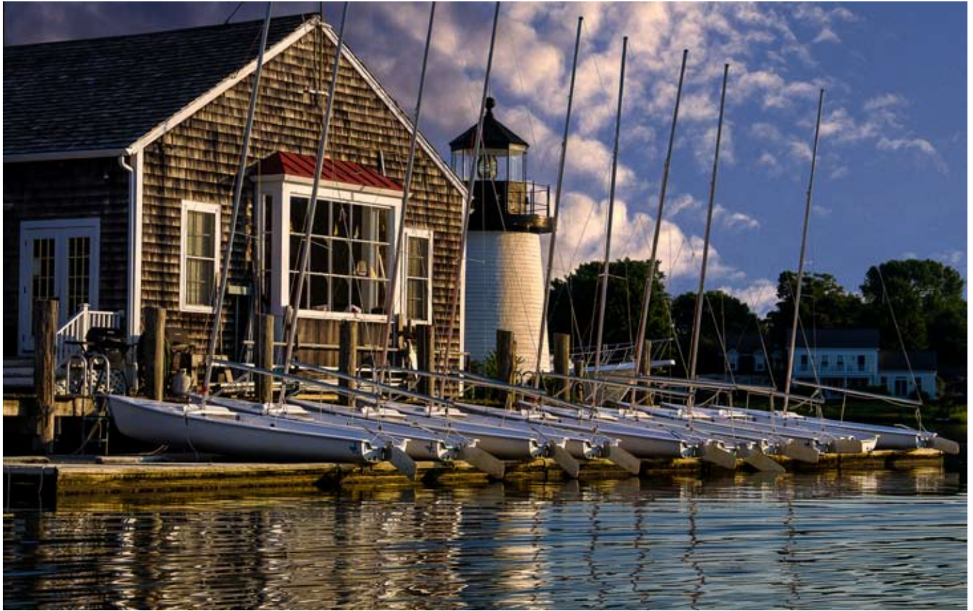
Mystic Seaport Museum - Sailing Center