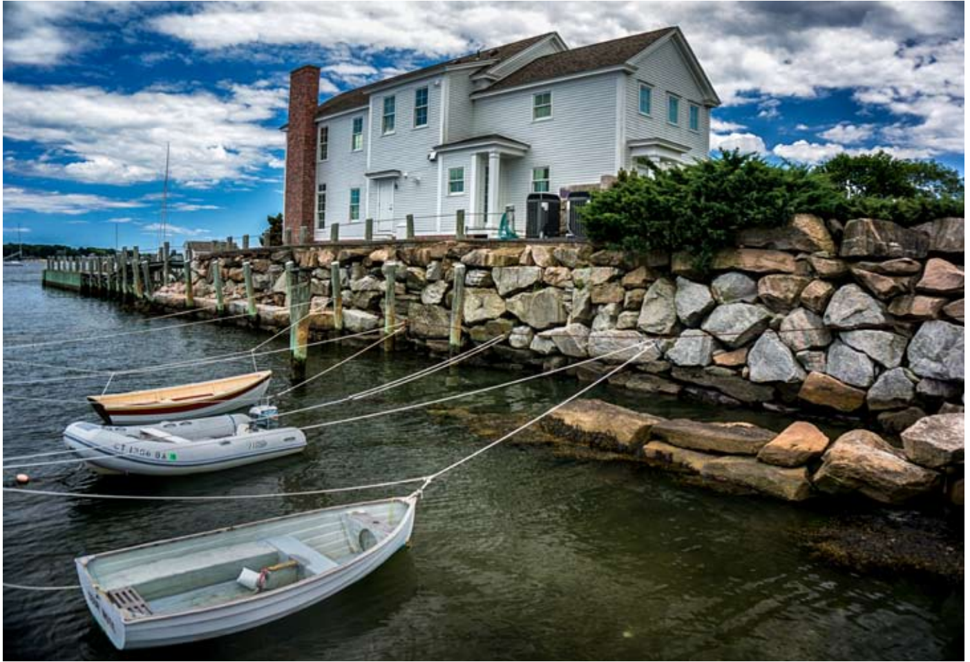
Front Street, Noank residence former 1960-70 restaurant