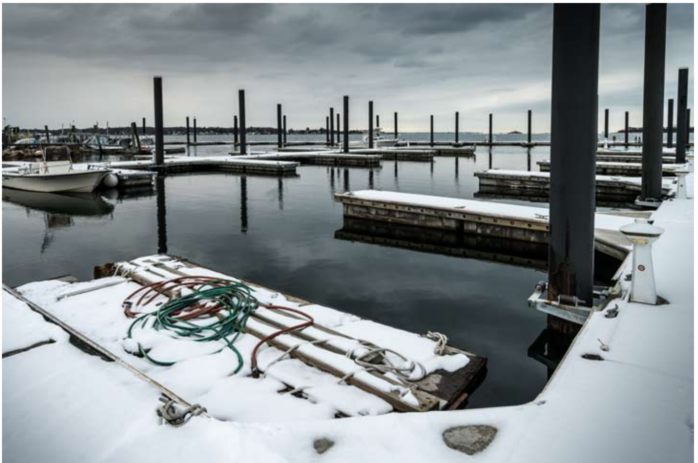
Dock in the snow