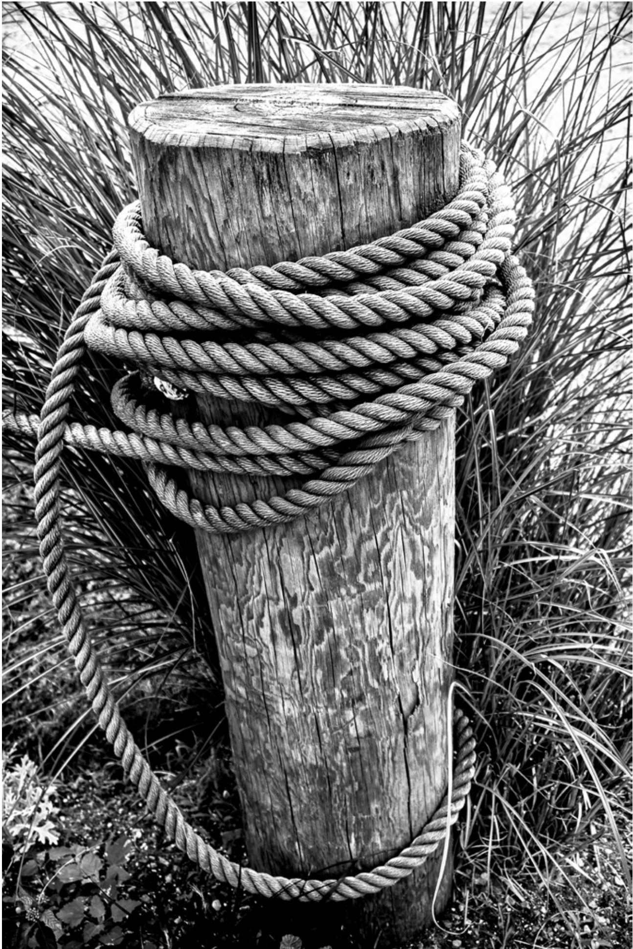
Noank Village Boatyard