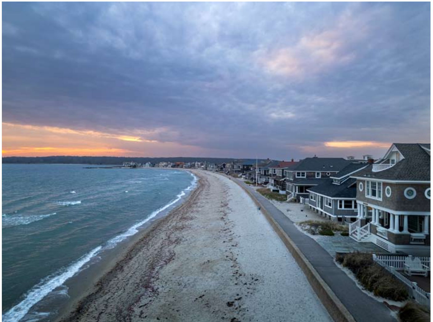
Drone shot of Groton Long Point South Beach