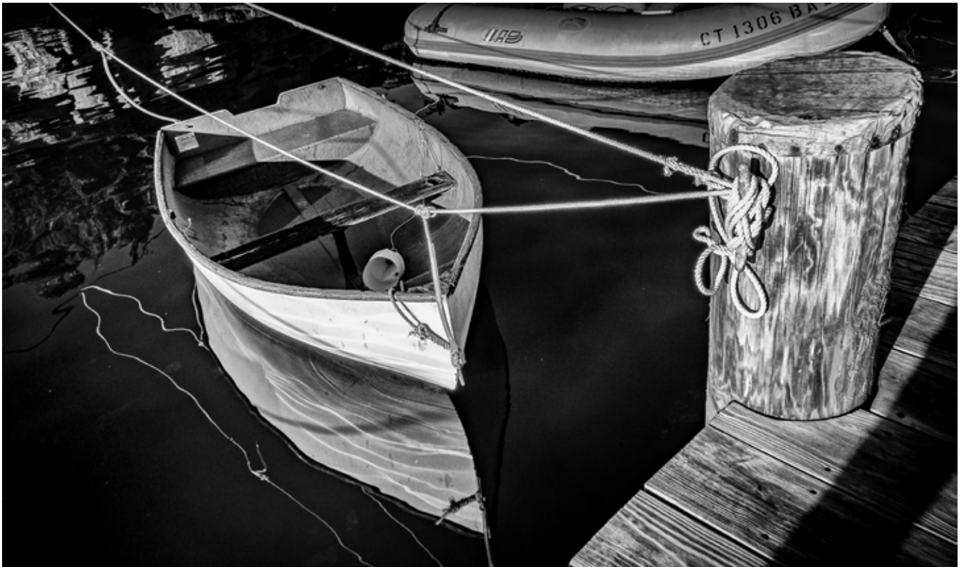
Noank Yaching Club dock.