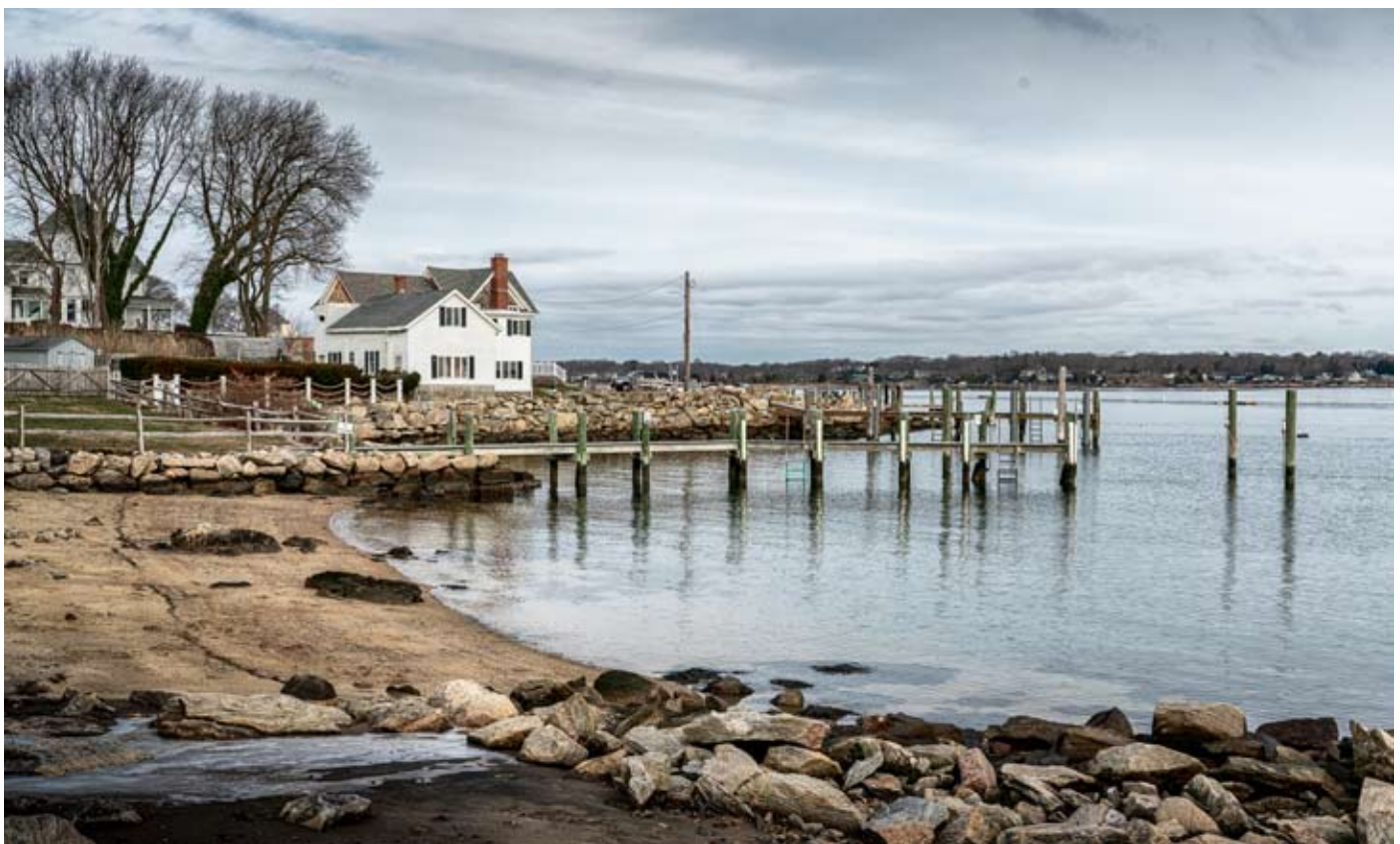
Snake Beach, Riverview Ave., Noank