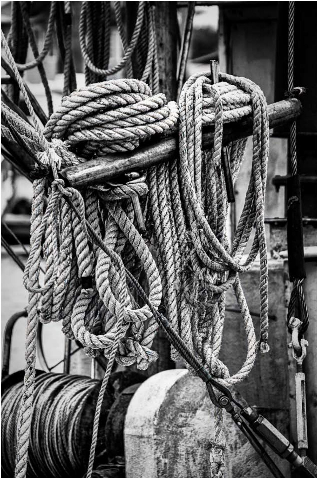
A working mans still life