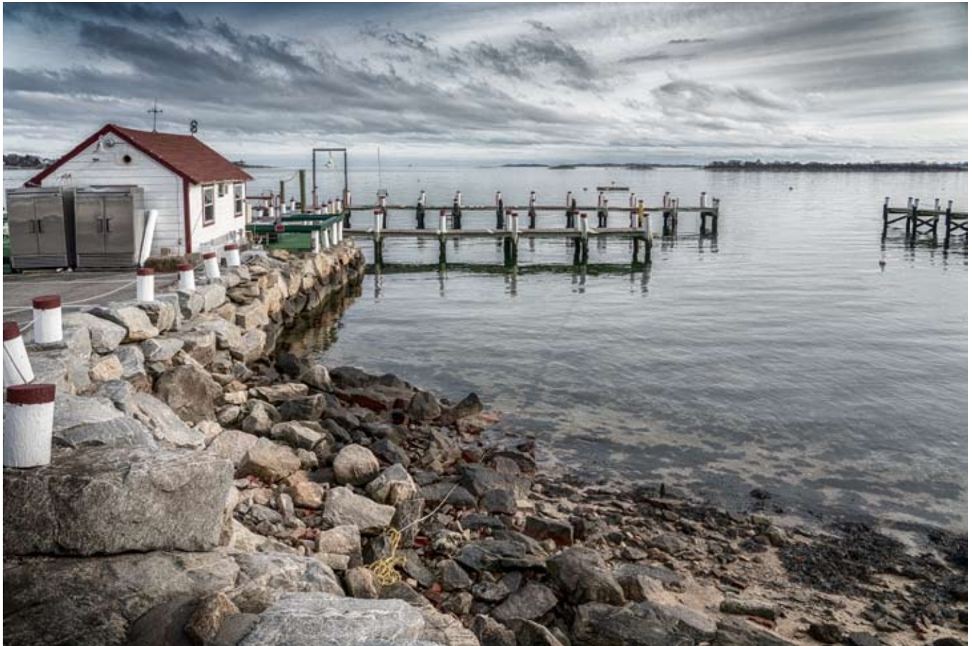
Haring's Restaurant, Noank formaly Ford's Lobster House circa 1970