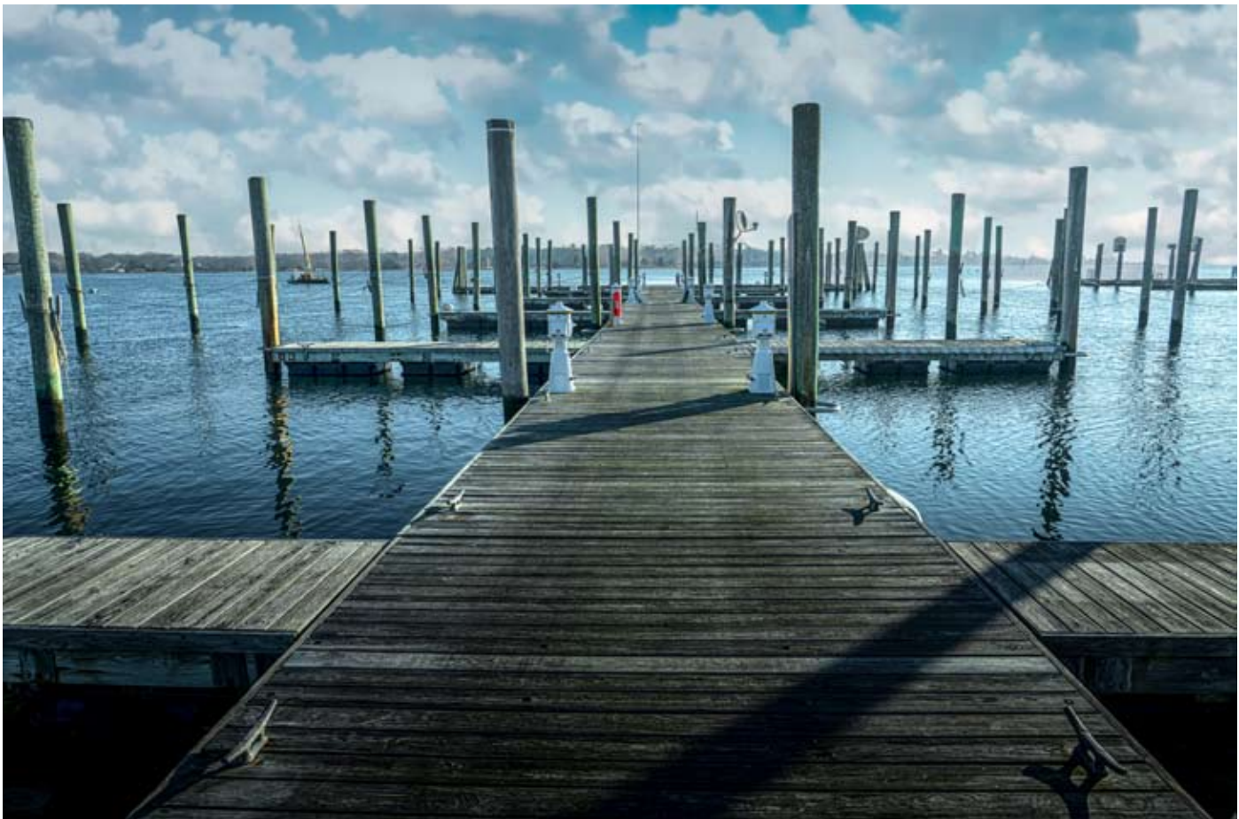
Empty Dock, Ram Island Yacht Club