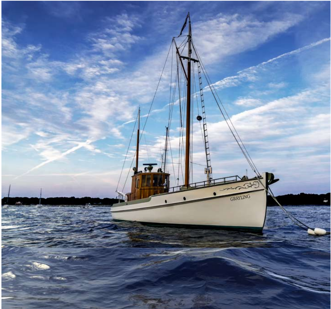
Mystic Harbor Grayling 1915 sardine carrier restored