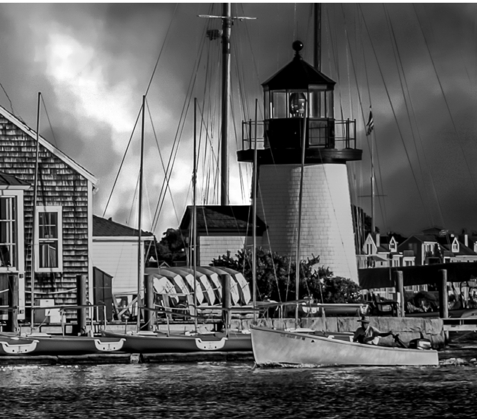
Mystic Seaport Museum - Sailing Center