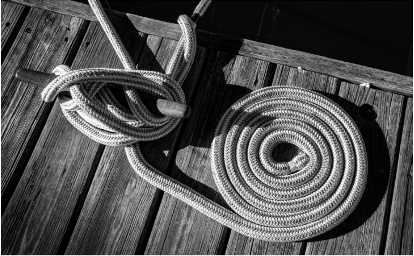
Coiled rope waiting