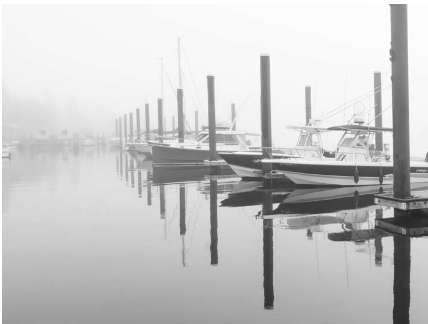
Waiting for a fishing trip