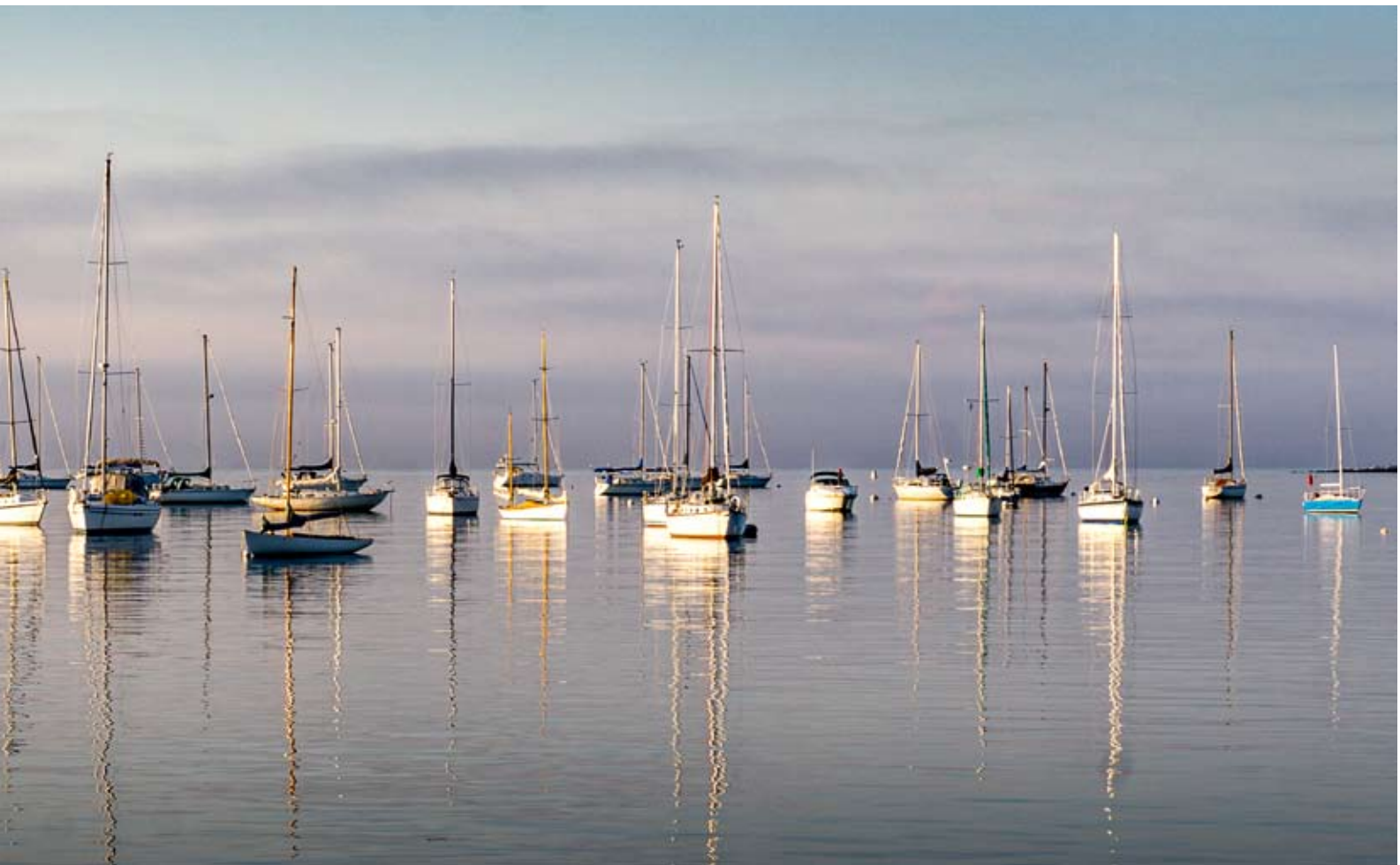
Noank Villiage Boatyard