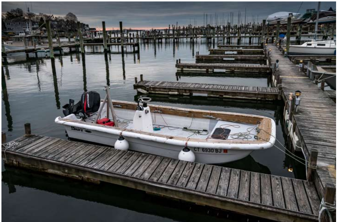
Dock at Sunset