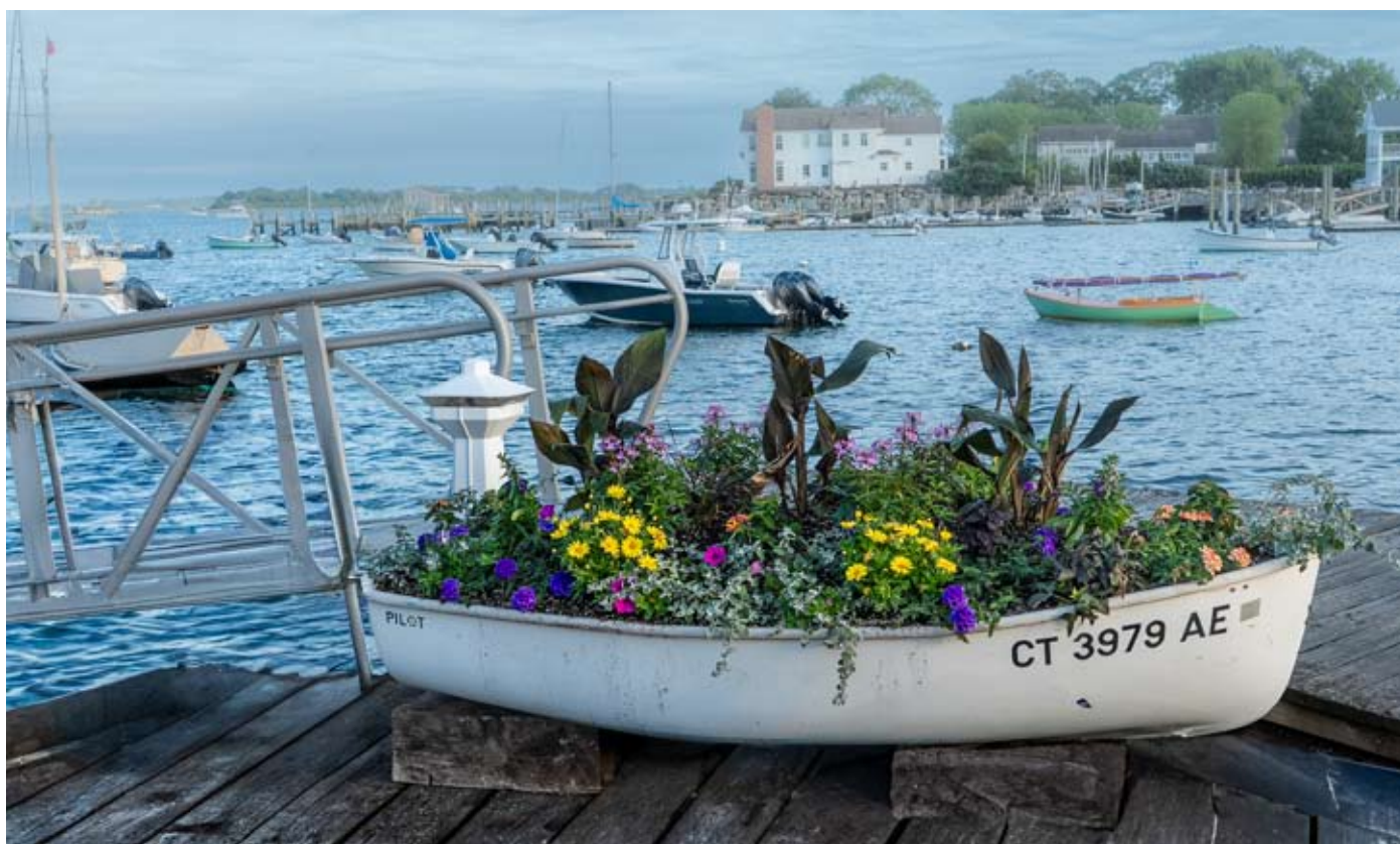
Noank Still Life