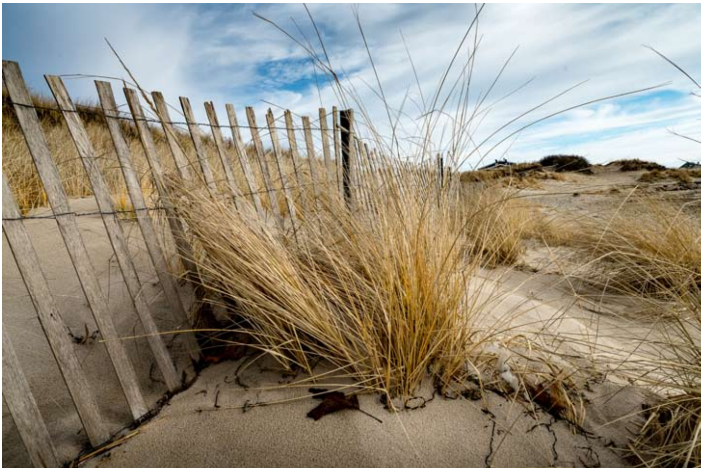
Napatree Point Conservation Area Watch Hill, Rhode Island