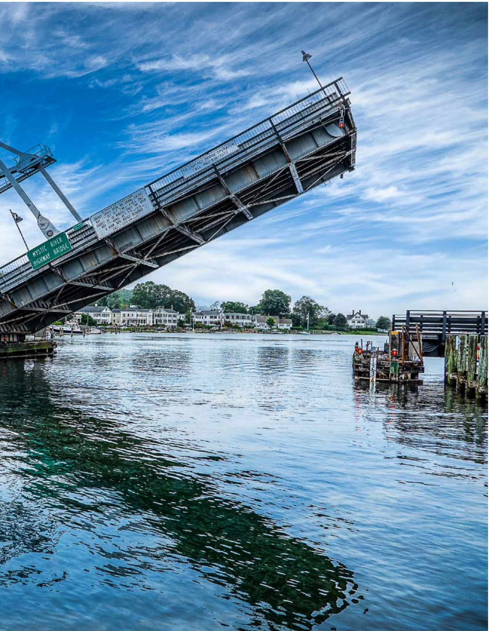
Mystic River Bascule Bridge