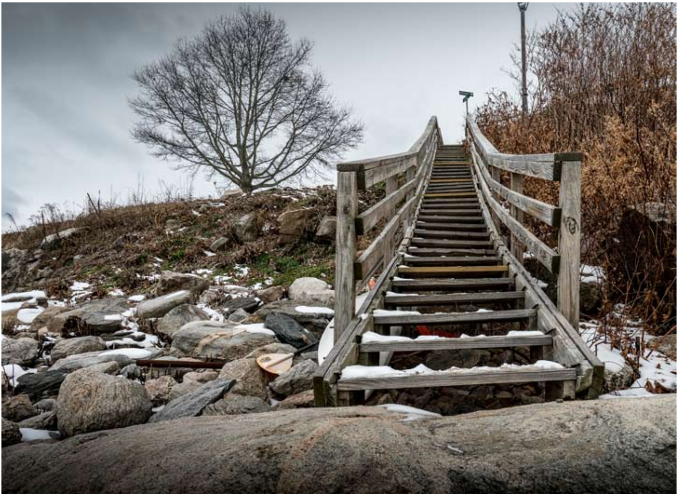
“Snake Hill Beach” locals name, public access off of Riverview Ave.