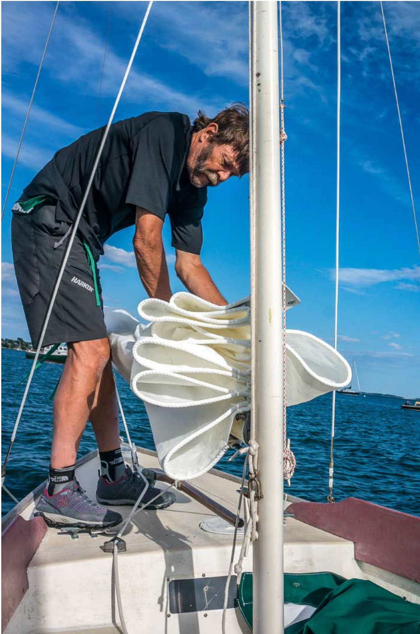
Chip on Cat's Paw