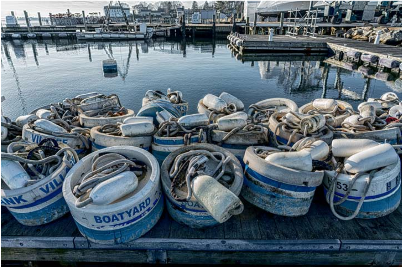
A working dock