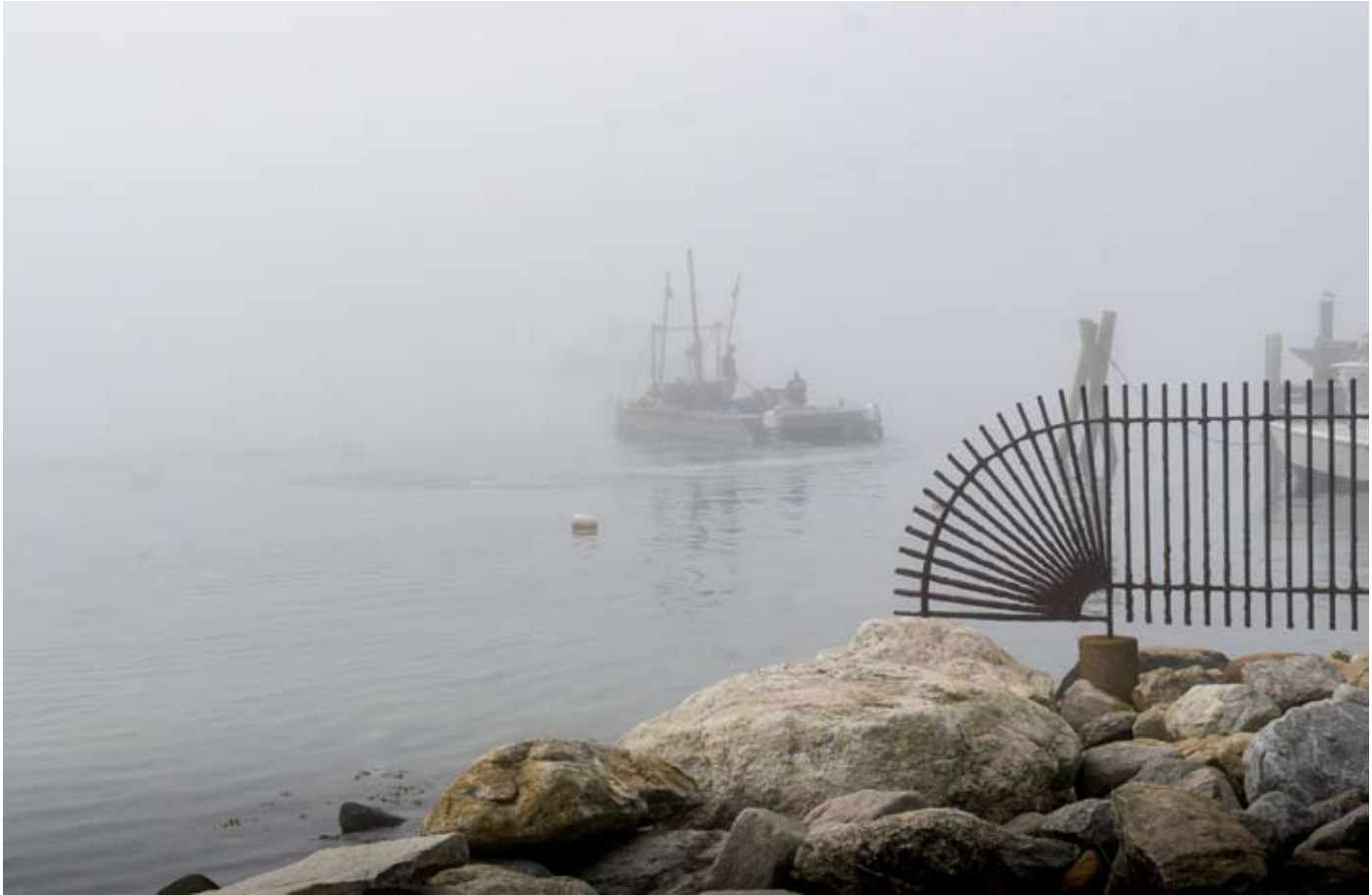
View from Main Street Dock and Beach