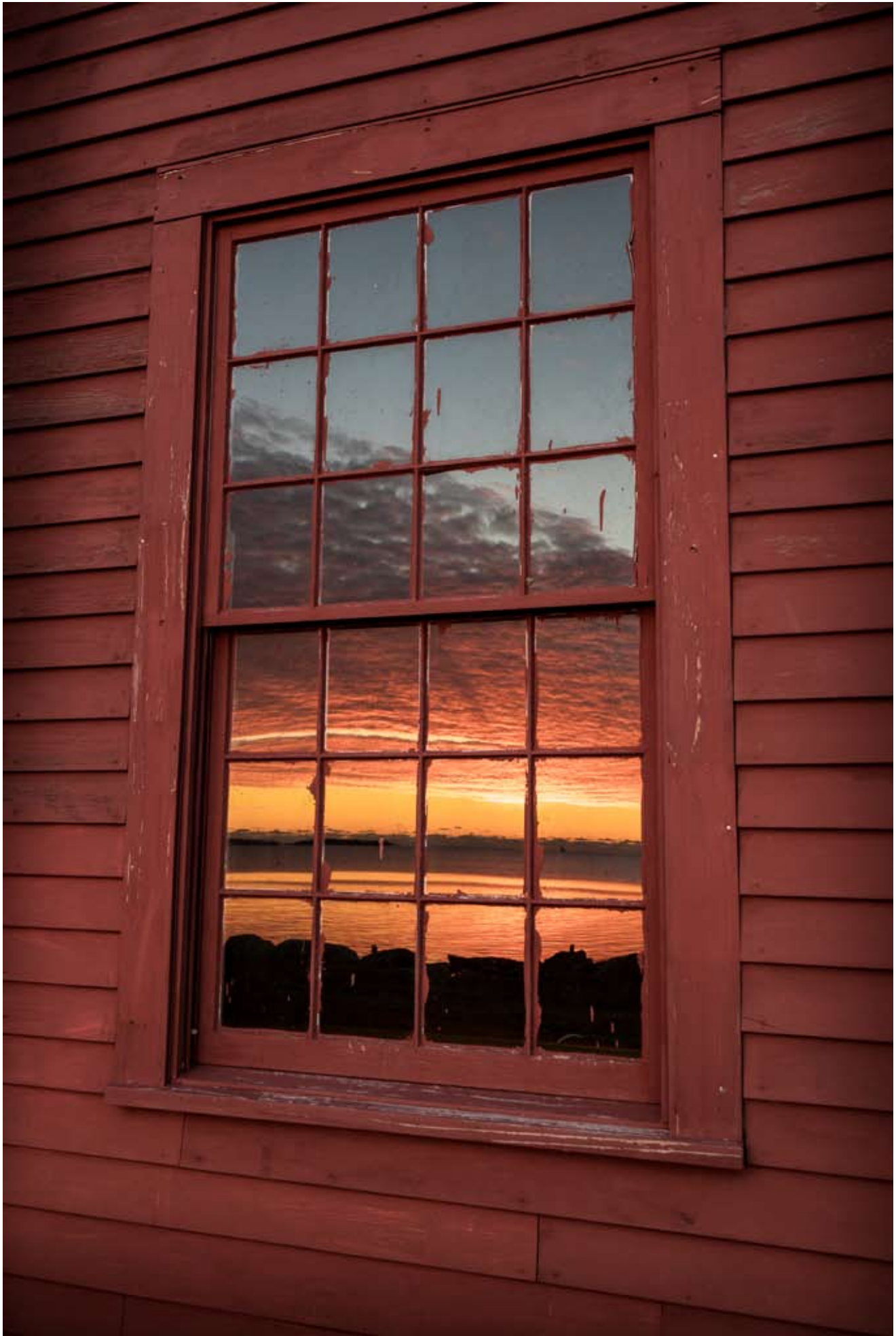
Sunset window view, Historic Lathem Chester Store - Noank