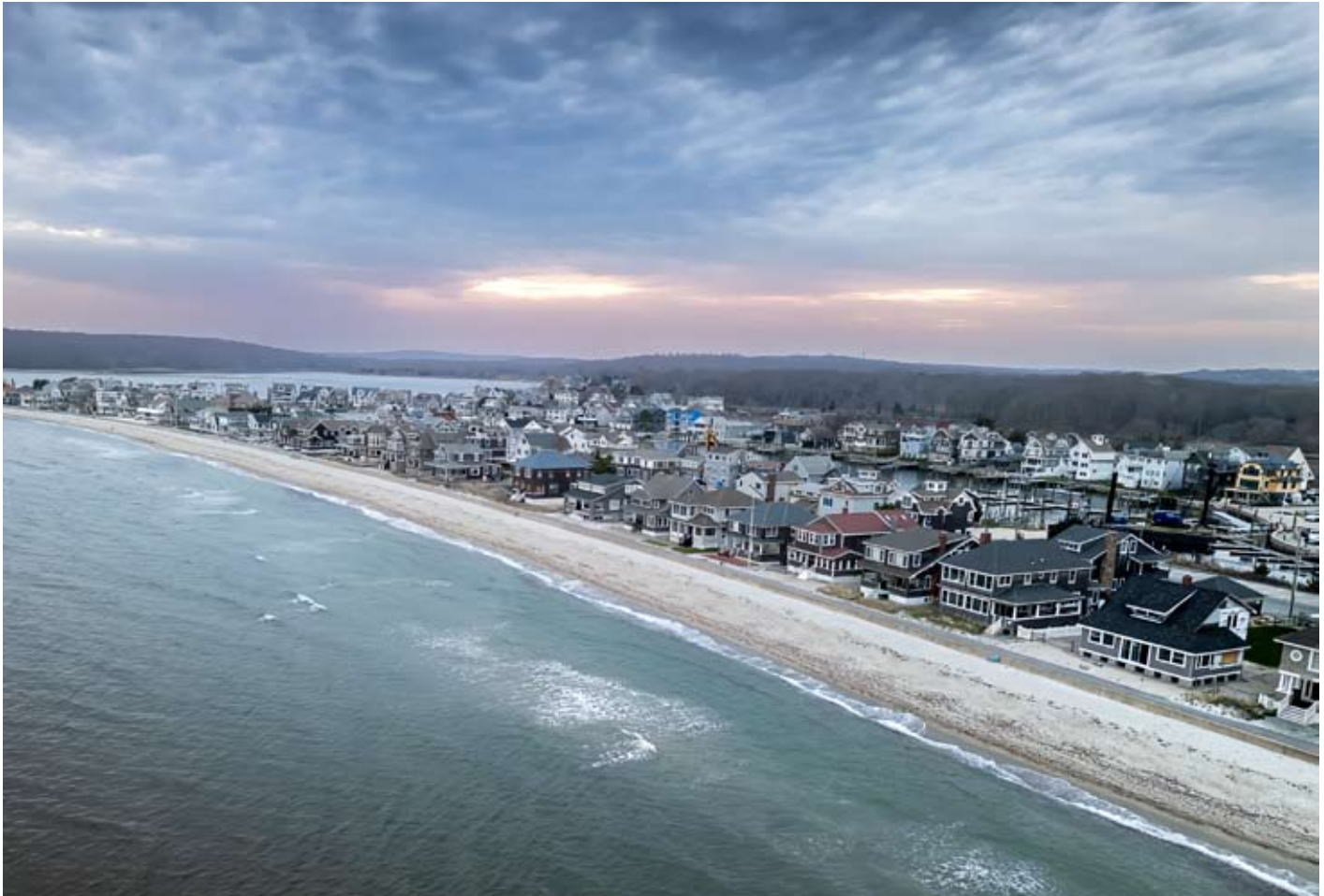
Drone shot of Groton Long Point South Beach